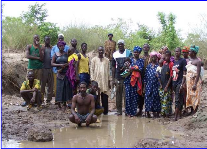
Twenty two men and women baptized in the name of the Father and of the Son and of the Holy Spirit!

The book of Acts is clear that genuine faith in Christ results in obedience to the ordinance of baptism. The first baptismal service for the new believers in Sunja took place on Sunday June 24, 2007. Twenty two believers walked from their village to a river and identified themselves with the death, burial and resurrection of Christ. The picture below demonstrates how genuine these followers of Christ are as they seek to please the Lord in all they do.