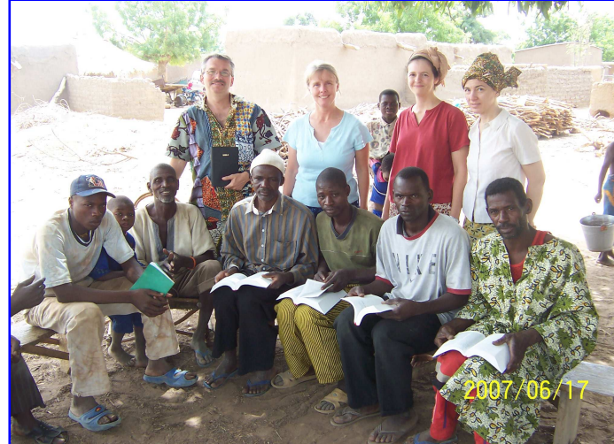
The church in Sunja is growing in the grace and knowledge of our Lord and Savior Jesus Christ!